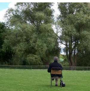
Dorset Reach