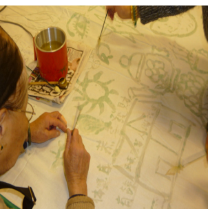
Images from work with Bristol & Avon Chinese Women's Group, Bristol Reach