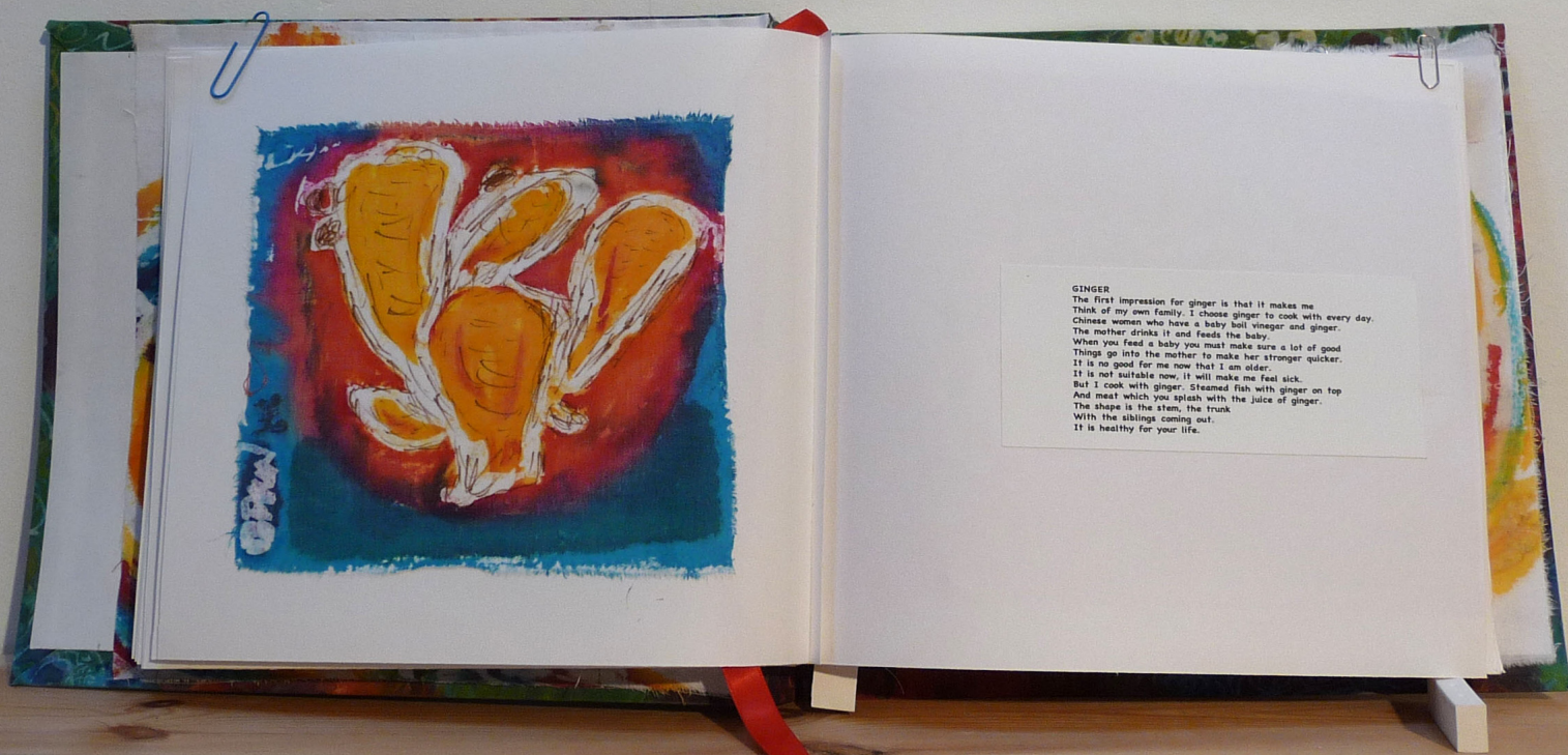
Booklet produced by participants, Bristol Reach