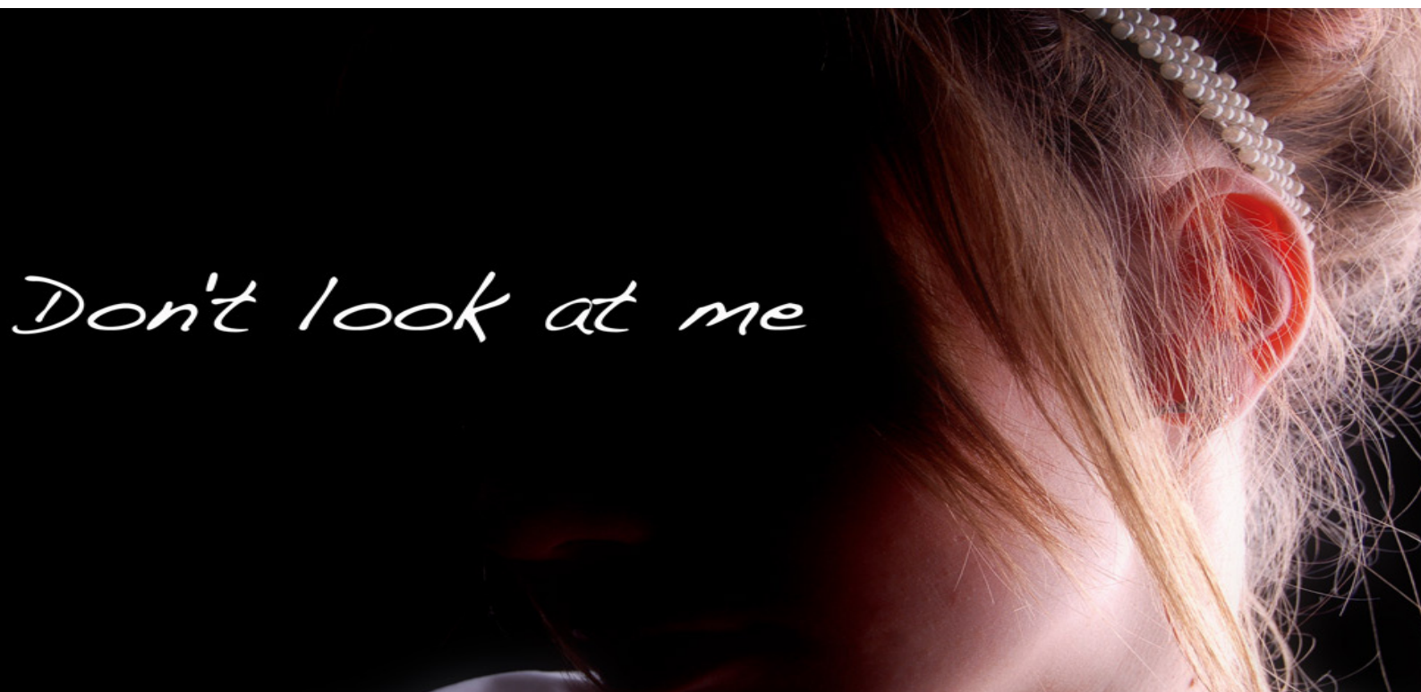
Image by young people from Huish Episcopi School, Langport Somerset Reach