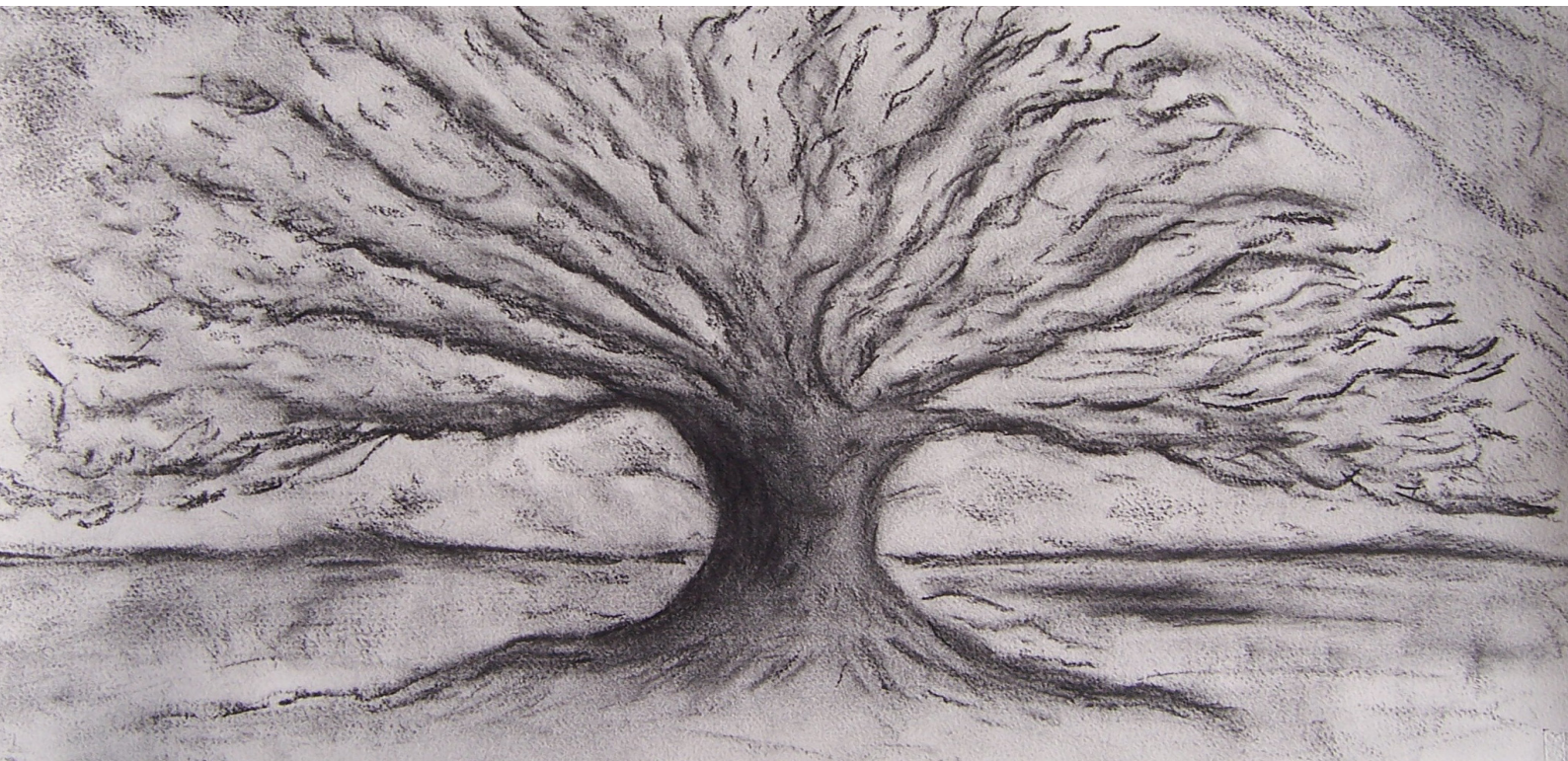
Drawing by project participant Dorset Reach Image: Rosie Jackson