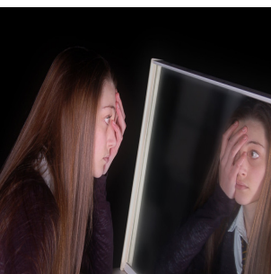
Image by young people from Huish Episcopi School, Langport Somerset Reach