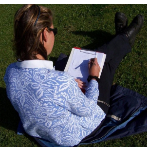
Dorset Reach